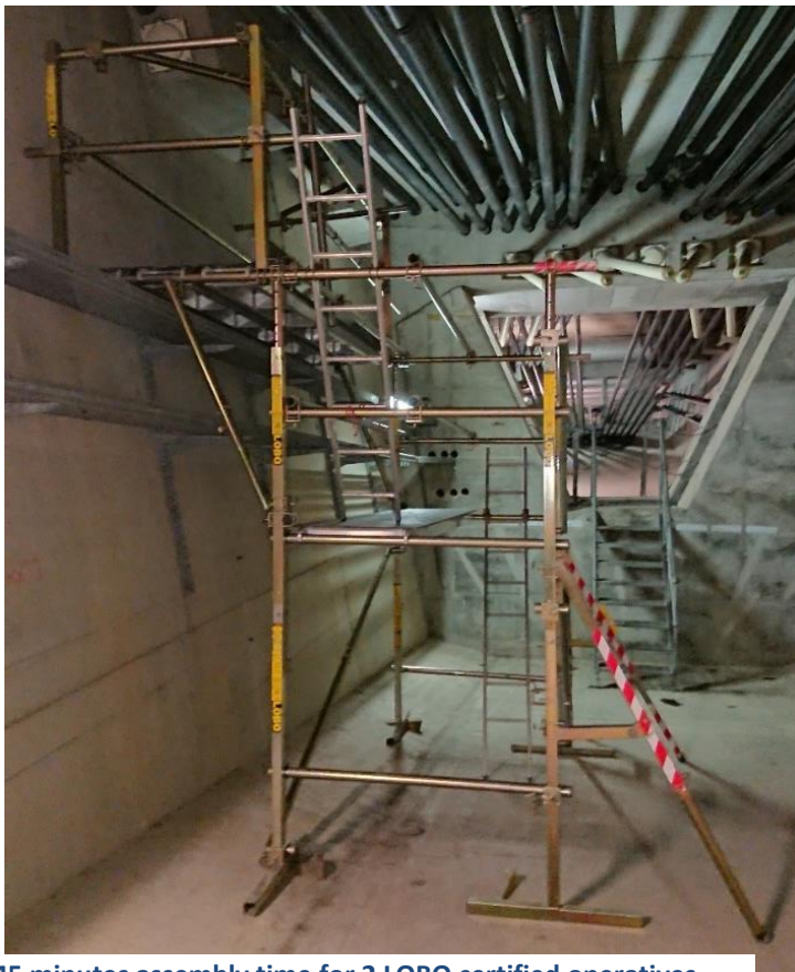
45 minutes assembly time for 2 LOBO certified operatives.

The LOBO System configured as a cantilever provides access to otherwise unreachable areas employing an extended platform at the top. LOBO is perfect for accessing machinery, mezzanines, tanks, plant, vessels, storage containers, or anywhere else a fixed and standard access product cannot reach while providing a safe, stable working platform.